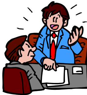
Want To Be In This Picture? Not Me.

The IRS and state of Arizona use tax data that has been reported on each tax payer. The IRS shares data with the State and the State shares infor-