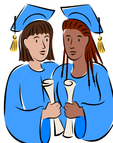
This could be you ...

The Lifetime Credit will allow you a maxi-